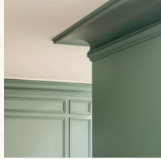
. grace . MINT TEA & BASIL