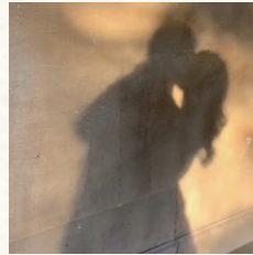
“ better half ” GROOM COLOGNE