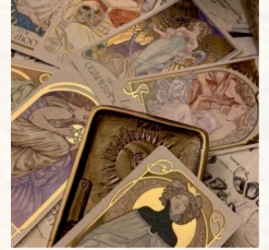
▫ radiant ▫ SPICED TANGERINE