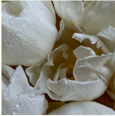
#relax WHITE MUSK