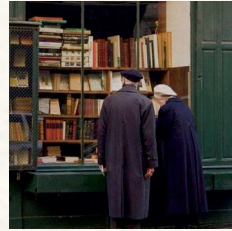
≈ forever ≈ CITRUS & SHADES