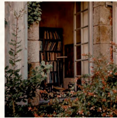
& CEDAR & OUD