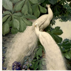
≡ timeless ≡ GREEN FIELD