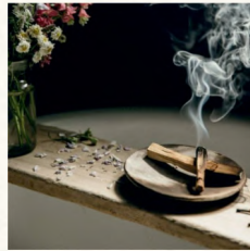
{ hygge } PALO SANTO