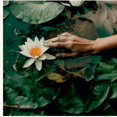
|heaven| WHITE LOTUS