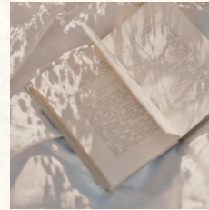
· cosy · SANTAL